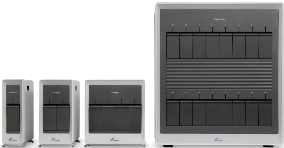
Figure 2. GeneXpert instruments with 1, 2, 4 and 16 modules

The range of GeneXpert instruments includes systems with 1, 2, 4, 16, 48 or 80 modules. Modules function independently so that batching is not required and individual tests can be started at different times. Results become available for each test in less than 2 hours, so a GeneXpert instrument with four modules (that is, the GeneXpert IV instrument) has the capacity to perform up to 16 tests in an 8-hour working day . Experience from sites using the platform has shown that during the initial 6-12 months of use, while laboratory staff and clinicians grow accustomed to the test, throughput may be only up to 8 tests a day; therefore, cartridge orders